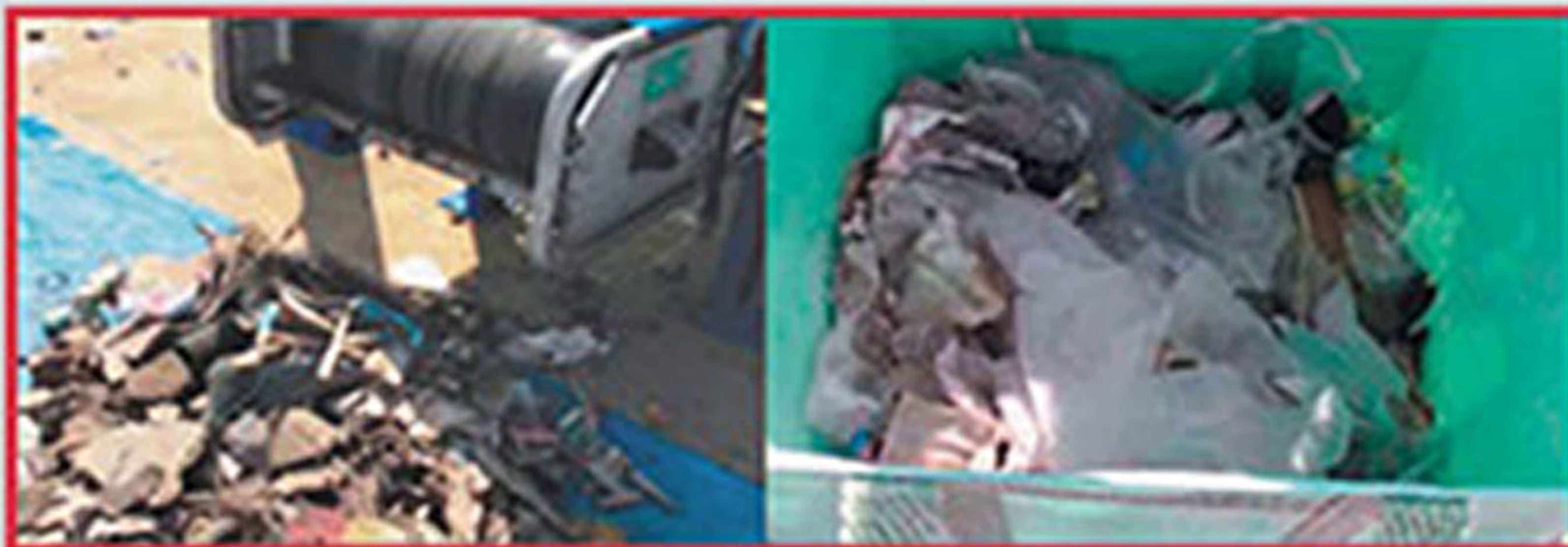
"Overs" with paper & film type plastic removed.