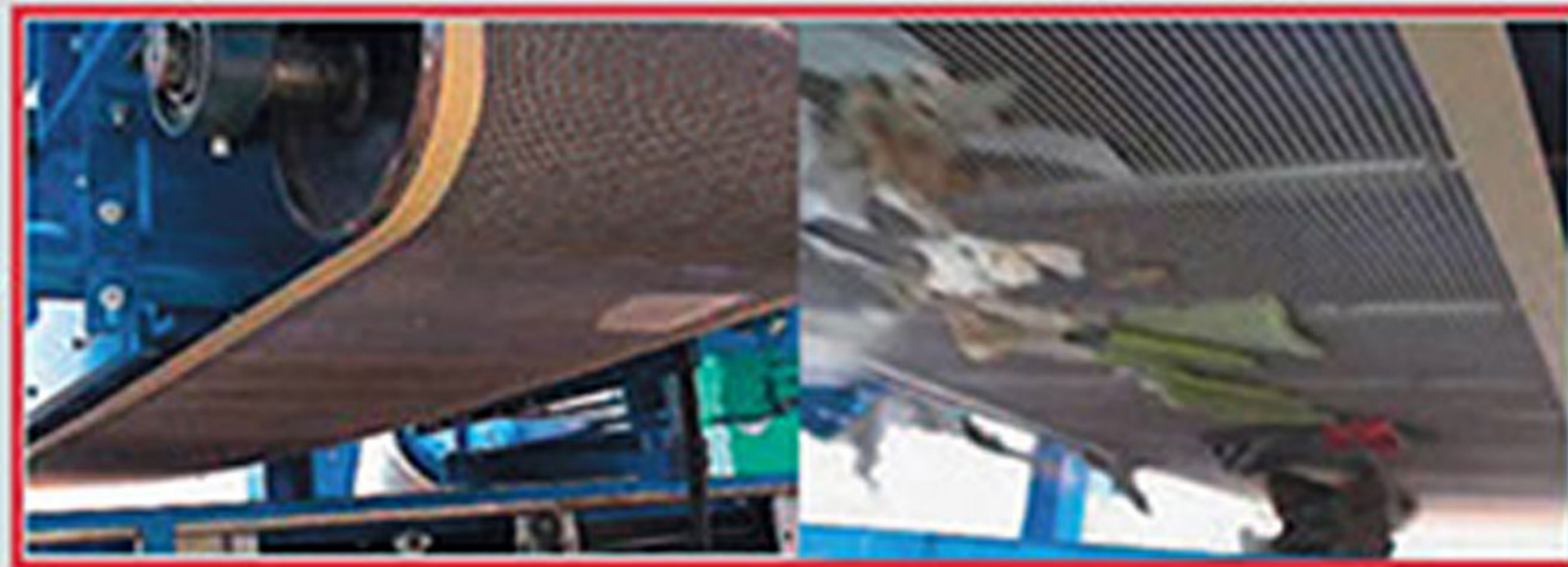
Collects target material on the conveyor by suction air.