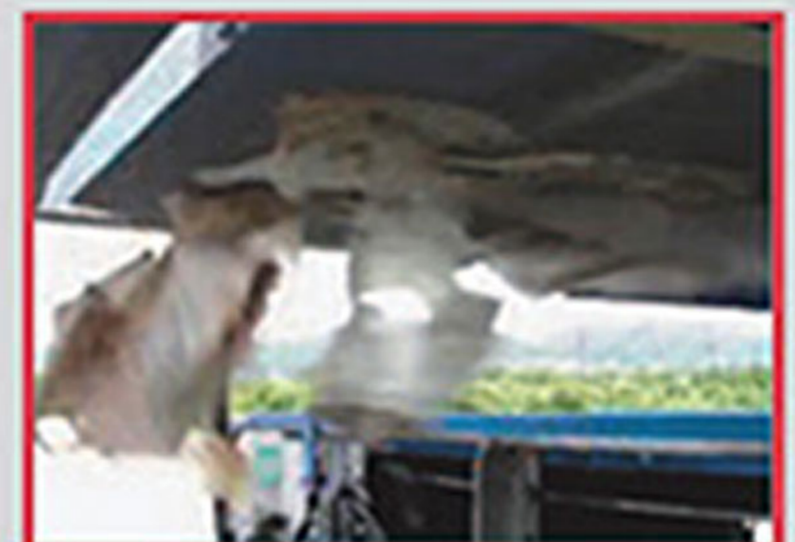
Blowing off the collected item at the end of net conveyor.