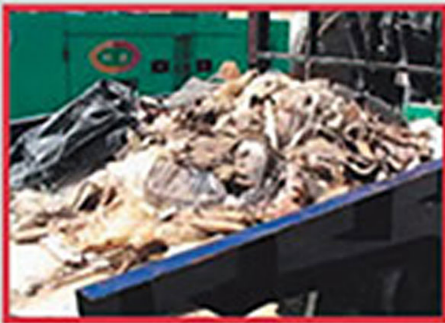
Miscellaneous waste placed on the conveyor.